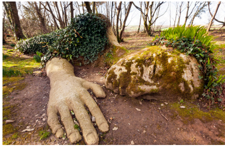
Lost Gardens of Heligan

With a stunning coastal backdrop and views over the town of Falmouth, Pendennis Castle is a wonderful place to explore. For the best views climb to the top of the Tudor Keep. Marvel at the display of big guns in the Field Train Shed and learn about the mighty power of these coastal defence weapons. The collection includes Tudor, Napoleonic, Victorian and 20th-century guns, each with information on how they would have been used. Or follow the tunnel down to the Half Moon Battery used during WWII.