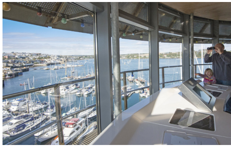
National Maritime Museum, Falmouth