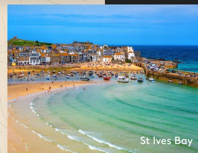
St Ives Bay

Wild, beautiful, creative and rural, Cornwall really is the stuff of legends. Historically a land of ancient myths and Celtic culture, today Cornwall is the perfect holiday idyll. A proudly unique and independent spirit is nurtured within this south-westerly peninsula, which is fringed with mighty sea cliffs, quaint harbour towns, beautiful bays and stunning beaches. Inland, the wild and woody interior conceals magical gardens and innovative projects, and the lovely towns are a treasure trove of excellent restaurants and vibrant cafés.