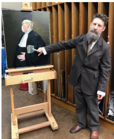
Restoring Manet's portrait